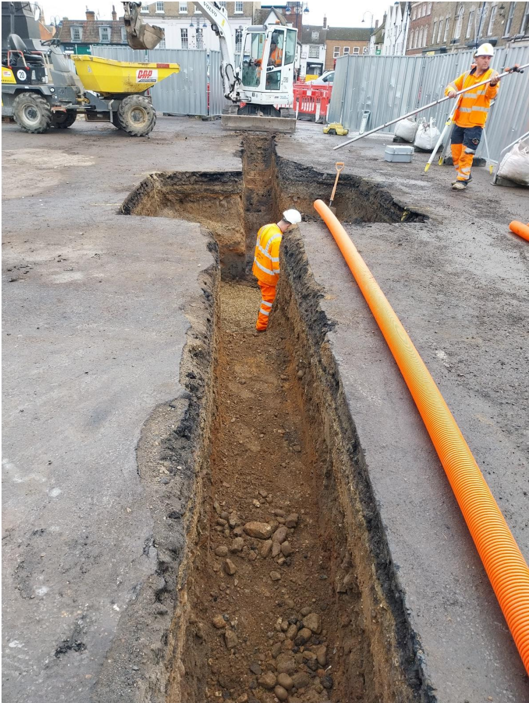
29/10/24 – Excavation for new electrical system ducts on south side of Market Square