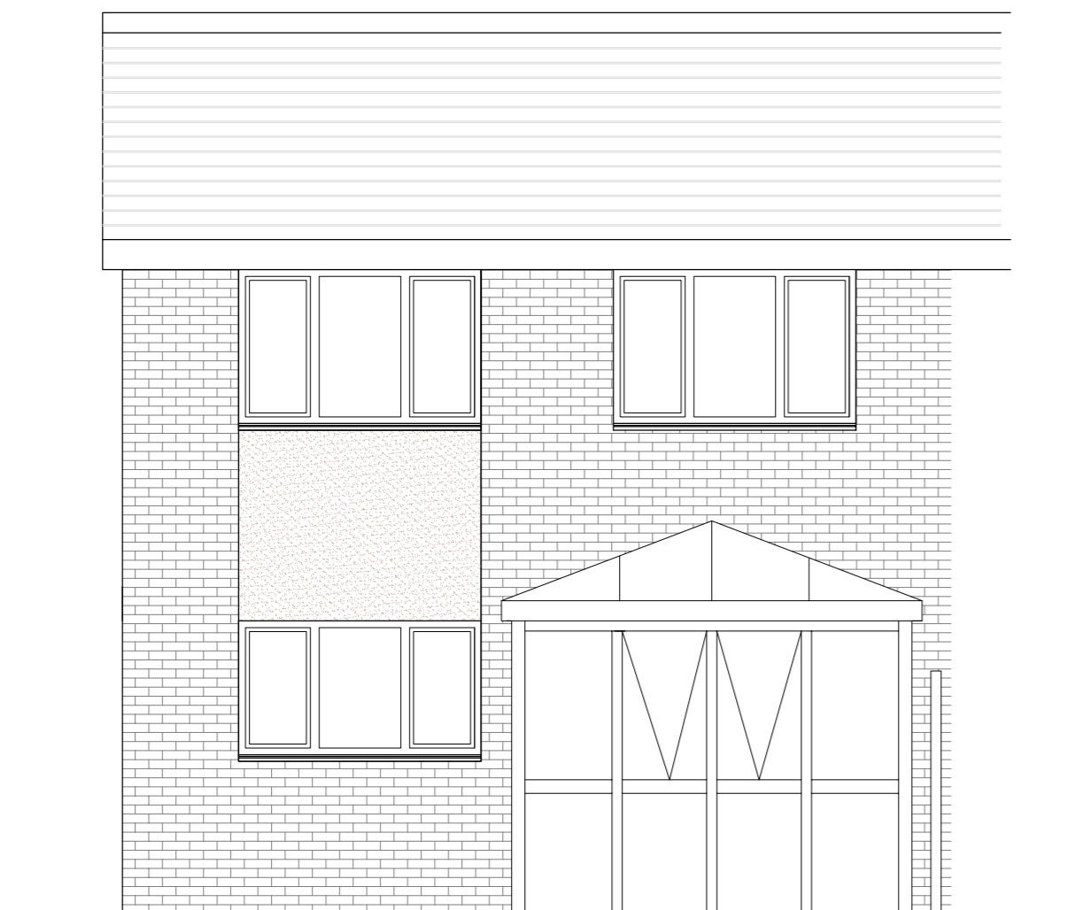
Existing Rear Elevation – Scale 1:50