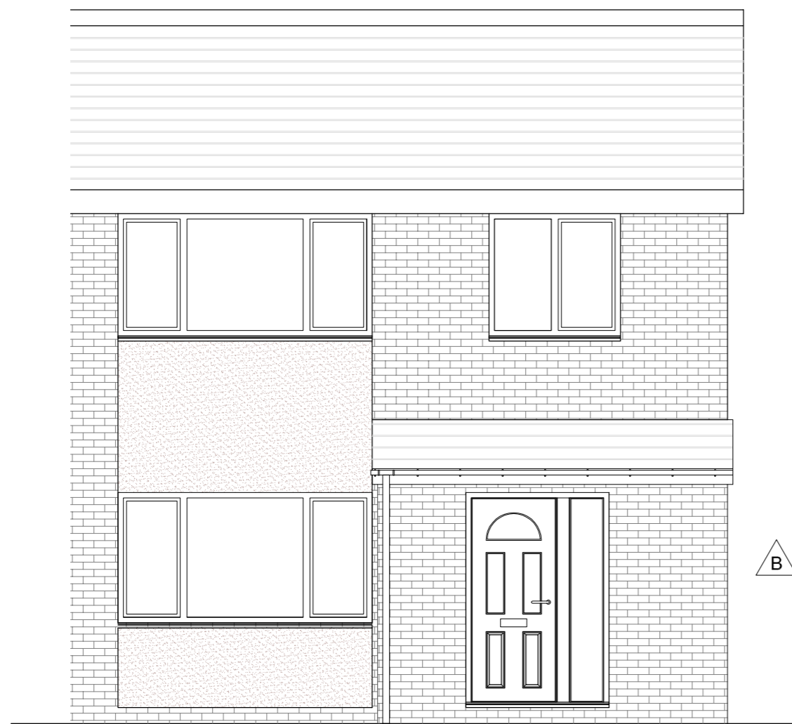
Existing Front Elevation – Scale 1:50