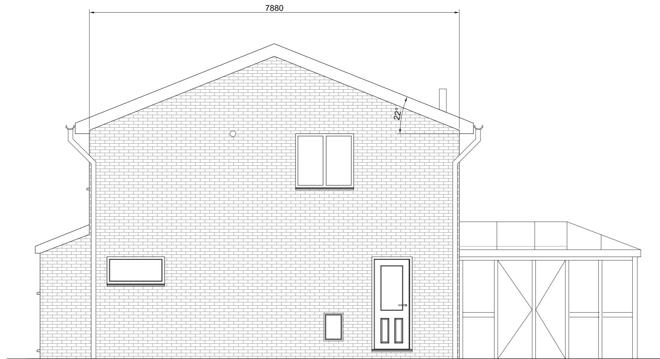
Existing Side Elevation – Scale 1:50