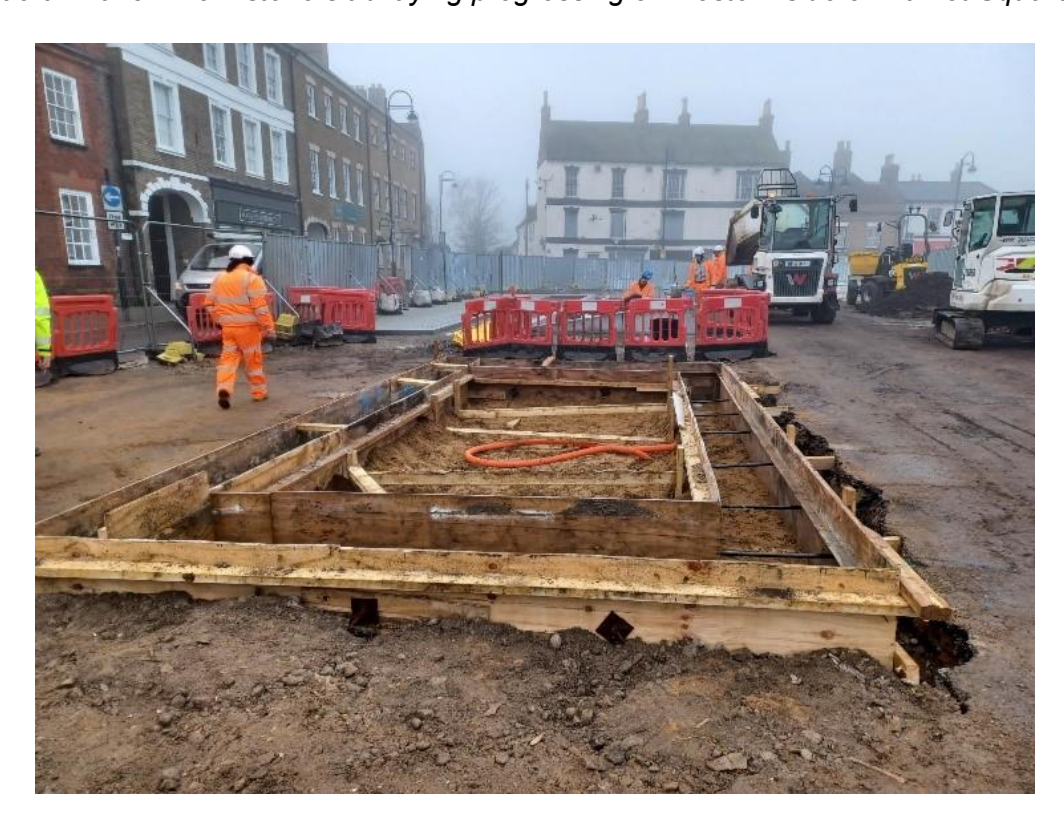
06/02/2025 - Shuttering constructed for rain garden 5 concrete foundation pour