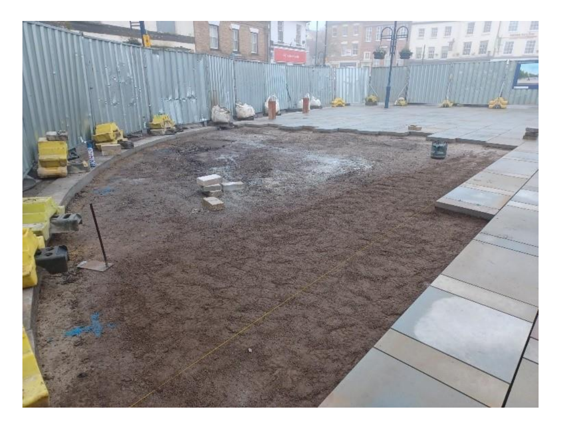
06/02/2025 – York stone slab laying progressing on western side of Market Square