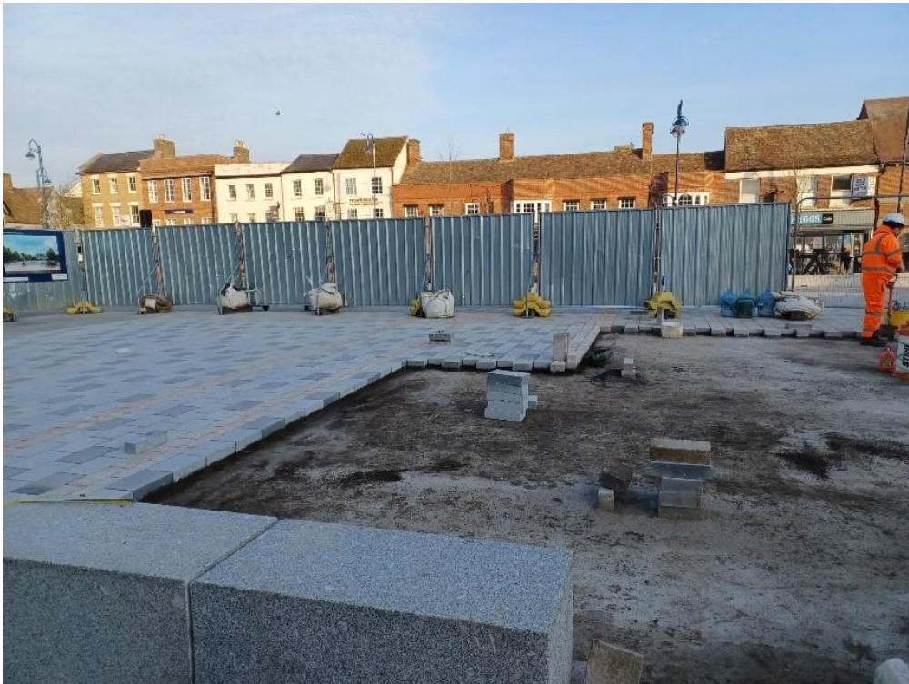
18/02/2025 – Granite slab laying Market Square south