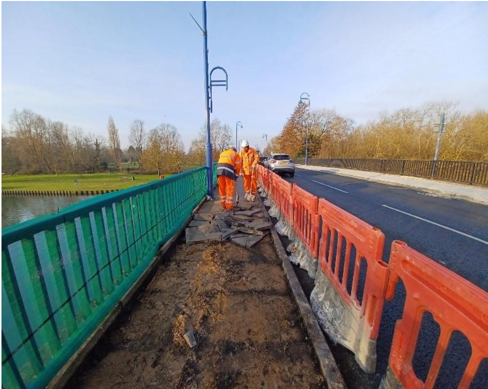
18/02/2025 – Bridge footway repaving in progress