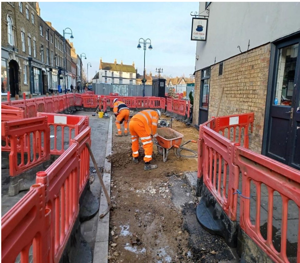
18/02/2025 – Preparation works for footway repaving outside the taxi office. The loading bay/taxi rank (left) is complete