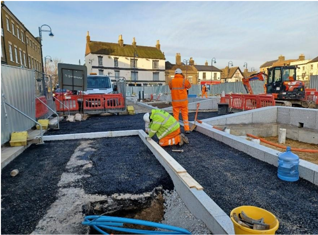
18/02/2025 – Surface level regulation on Market Square south in preparation for York stone slab laying (footway) and sett laying in disabled bays (left)